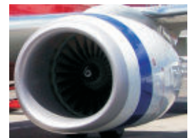
Commercial Jet Ingestion Tests