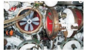
Component R & D Testing