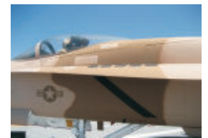
Jet Performance Testing