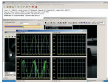
Multiple Channel Data Acquisition Synchronized To Each Frame